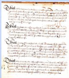
1717 circular proposing the establishment of the PBF